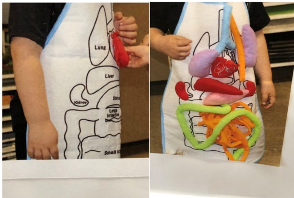
Figure 2. Example of Digestive system model in ELC 3 room

these themes, exemplars from teachers' planning documents and interview responses provide an interpretive view of their beliefs and practices in using technology for children's science engagement (Campbell & Jobling, 2010).