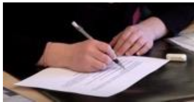
Figure 1. A student is underlining unusual words

The teacher starts by telling the students to underline the words in the text that they find a bit unusual and difficult to understand, and she goes on reading the text aloud.