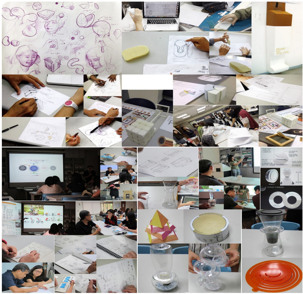
Figure 2. The process of observation of design course teaching and recording of imagination ratings