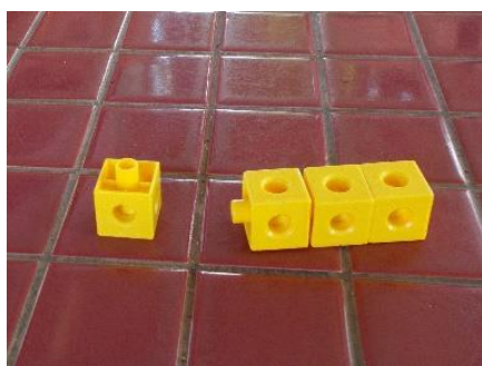
a) 3 (in a line) and 1 by Qaisya