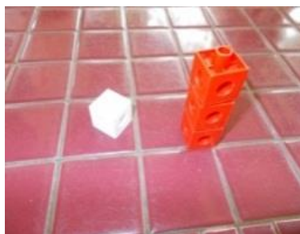
c) 3 (in a pile) and 1 by Aimy