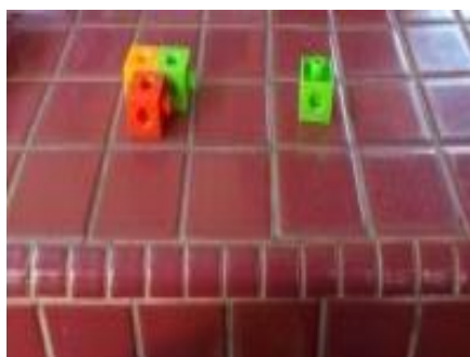
b) 3 (in a group) and 1 by Rozy