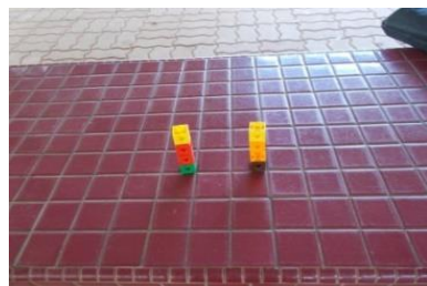
b) Photographing cubes (4 and 4 made 8) -by Rozy