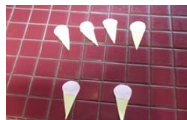
d) Photographing (4 and 2 made 6) – by Aimy