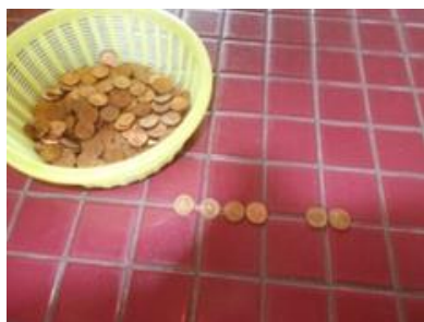
a) Photographing coins (4 and 2 made 6) – by Norman