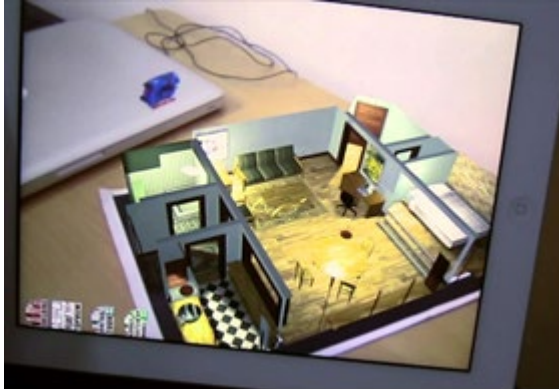
Figure 2. Informational model of a building

To carry out a similar project using traditional methods would be much more time- and energy-consuming. What's more, the final result would be much less informative for the consumers who do not possess even basic knowledge of building design; all the conventional signs and markers seen in the model as well as the importance of constructive elements have to be understandable for the end user.