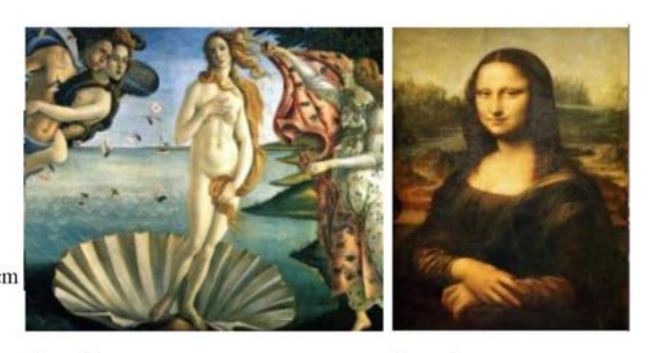
Picture 3 Picture 4 Figure 1. Woman Depictions Created in Between Paleolithic and Baroque Periods

4. Leonardo Da Vinci, Mona Lisa , 1507, Oil on Wood Panel, 77 x 53 cm