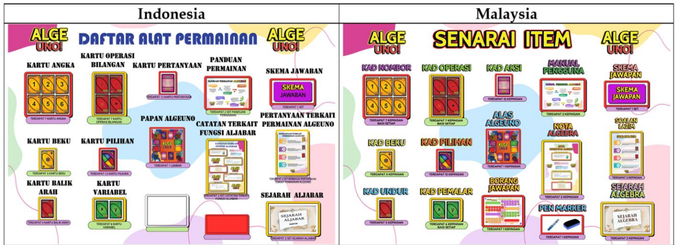
Figure 1. Representative AlgeUno algebra and action cards integrating symbolic manipulation tasks

UNO, including turn-taking, matching rules, special action cards, and strategic play, are systematically aligned with algebraic tasks such as equation solving, symbolic manipulation, and representational interpretation.