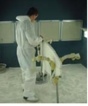
(c) Shaping the rails (\sim 70\%, \text{both genders})