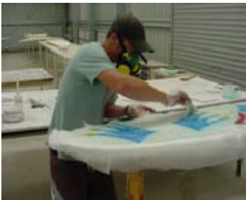
(d) Working with Glassed-in Ornaments (~60%, both genders)