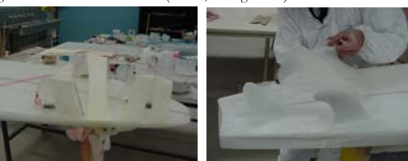
(h) Positioning and Setting up the FCS and the Glassed-on Fins (\sim 40\%, \text{both genders})