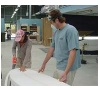
(a) Cutting the shape (\sim 20\%, mostly females)