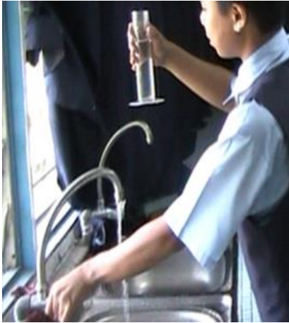
Figure 2. Student 3 lifted the measuring cylinder during measurement