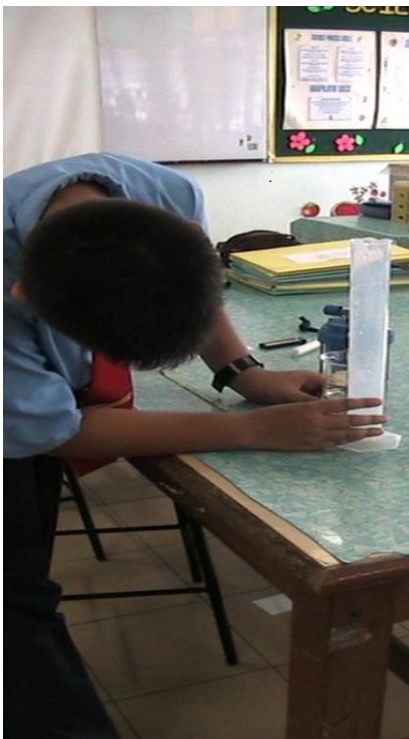
Figure 3. Student 4 tilted his head when reading the meniscus

In other cases, the students tilted their head while taking measurement instead of lowering their head to get accurate readings (refer to Figure 3 ). Some of the students chose a different option to simplify the task. For instance Student 4, 'checked on the volume of water by placing the measuring cylinder on the tripod stand' (Obs.1, Eps.2, S3a). Doing this placed the meniscus parallel to his eye level so he did not have to lower his eyesight.