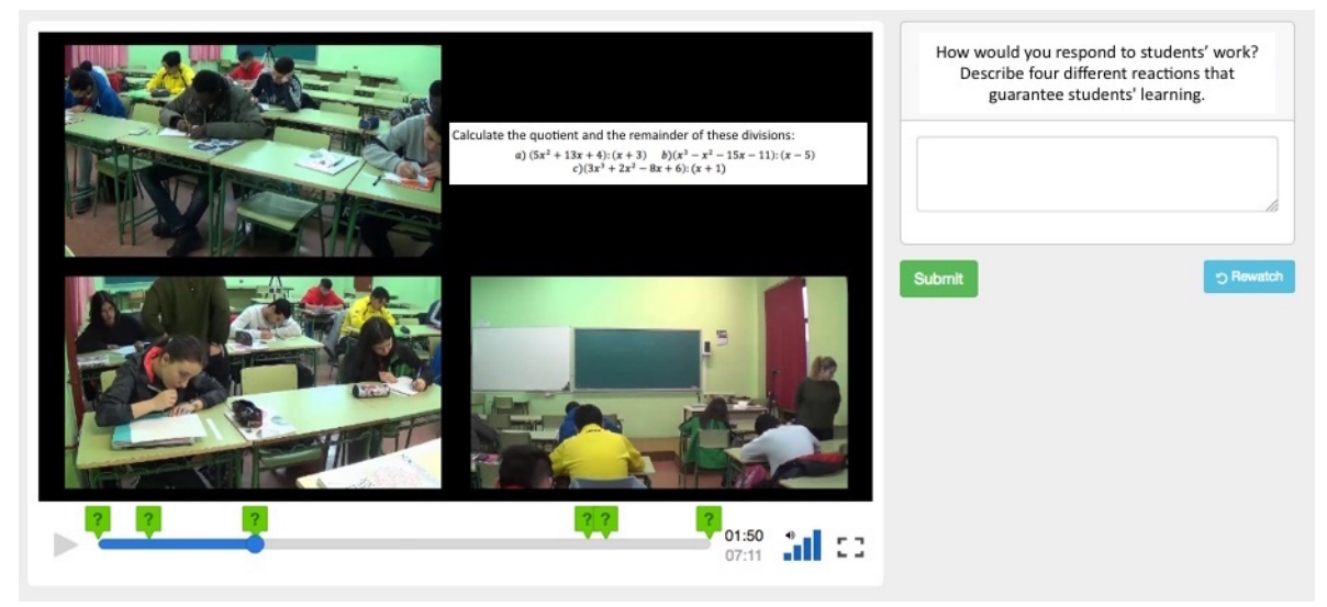
Figure 2. Example of a video-vignette

fitting the theoretical feedback framework. Nevertheless, we will return to the issue of sample size in the discussion section since it is a limitating factor in view of generalizing our specific results to the larger population of students.