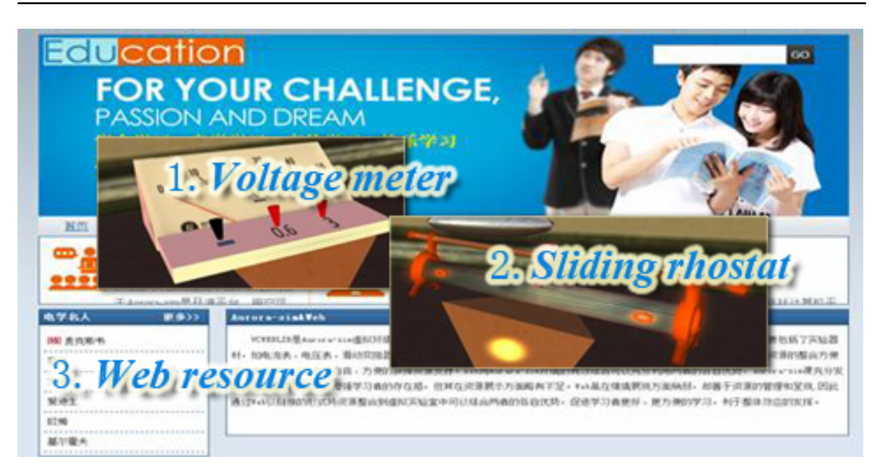
T. Xie et al. / Perceived Effectiveness of Science Inquiry in the 3D Virtual World