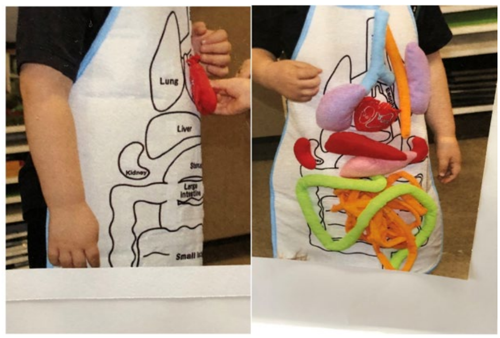
Figure 2. Example of Digestive system model in ELC 3 room

these themes, exemplars from teachers' planning documents and interview responses provide an interpretive view of their beliefs and practices in using technology for children's science engagement (Campbell & Jobling, 2010).