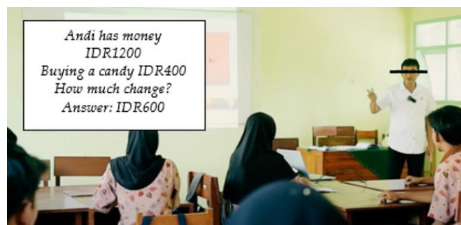
Figure 3. Senior teacher' using MLTP-type single solution as ice breaking

The senior teacher realized that the main goal of the MLTP was to train students' mathematical creativity, but he realized that creativity problems are usually