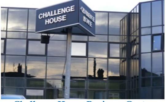
Challenge House Business Centre

Published by: MODESTUM LIMITED Publication Office: Suite 124 Challenge House 616 Mitcham Road, CRO 3AA, Croydon, London, UK Phone: + 44 (0) 208 936 7681 Email: publications@modestum.co.uk Publisher: http://modestum.co.uk Journal Web: http://www.ejmste.com Twitter: https://twitter.com/ejmste Facebook: https://www.facebook.com/ejmste